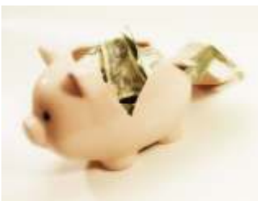
San Bernardino's economic reserves are gone. .

Democracy is a device that insures we shall be governed no better than we deserve. George Bernard Shaw