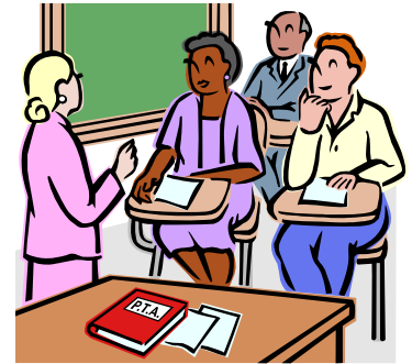
Studying area schools...

"this is the reason we joined the League — to study the issues and influence public decisions from an informed and well thought out perspective."